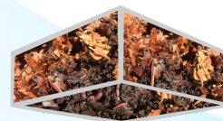
Wood Shavings, Worms, and Microbes